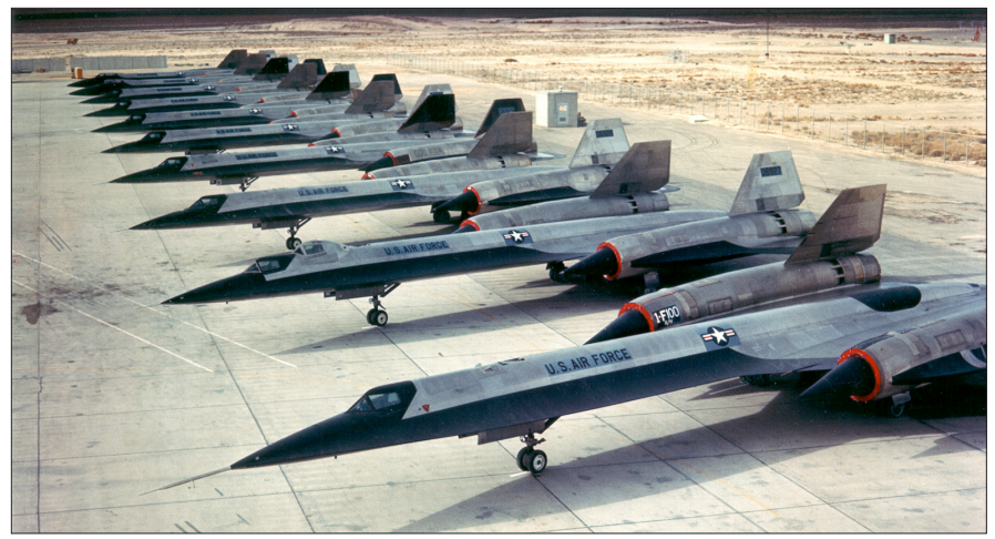
Figure 3: The SR-71 Aircraft