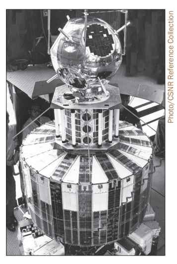
Figure 5: Grab, Piggybacked Atop TIROS

reconnaissance program. These three programs, together with the CIA's A-12 and Air Force's SR-71 reconnaissance aircraft programs, were the building blocks of what would become the National Reconnaissance Office.