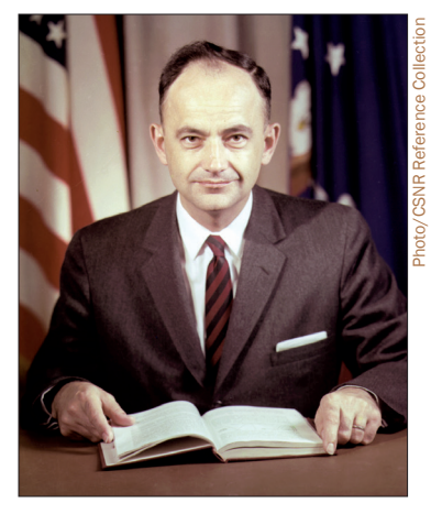
Figure 7: Dr. Joseph V. Charyk