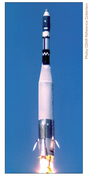
Figure 9: Gambit-1 launch

By the time Gambit had completed 14 missions, testing and development was almost completed. In all, Gambit (KH-7) flew 38 missions through June 1967, and its followon, Gambit-3 (KH-8), flew 54 missions from July 1966 through April 1984, achieving ground resolutions of better than two feet. In the late 1960s, space missions had become so reliable that only three Gambit-3 missions failed to produce any intelligence, and those three failures were due to launch problems that failed to get the satellites into orbit. By the time Gambit-3 began regular launches, U.S. analysts knew, for instance, almost precisely at what rate the new Soviet T-62 tank was being delivered to Soviet