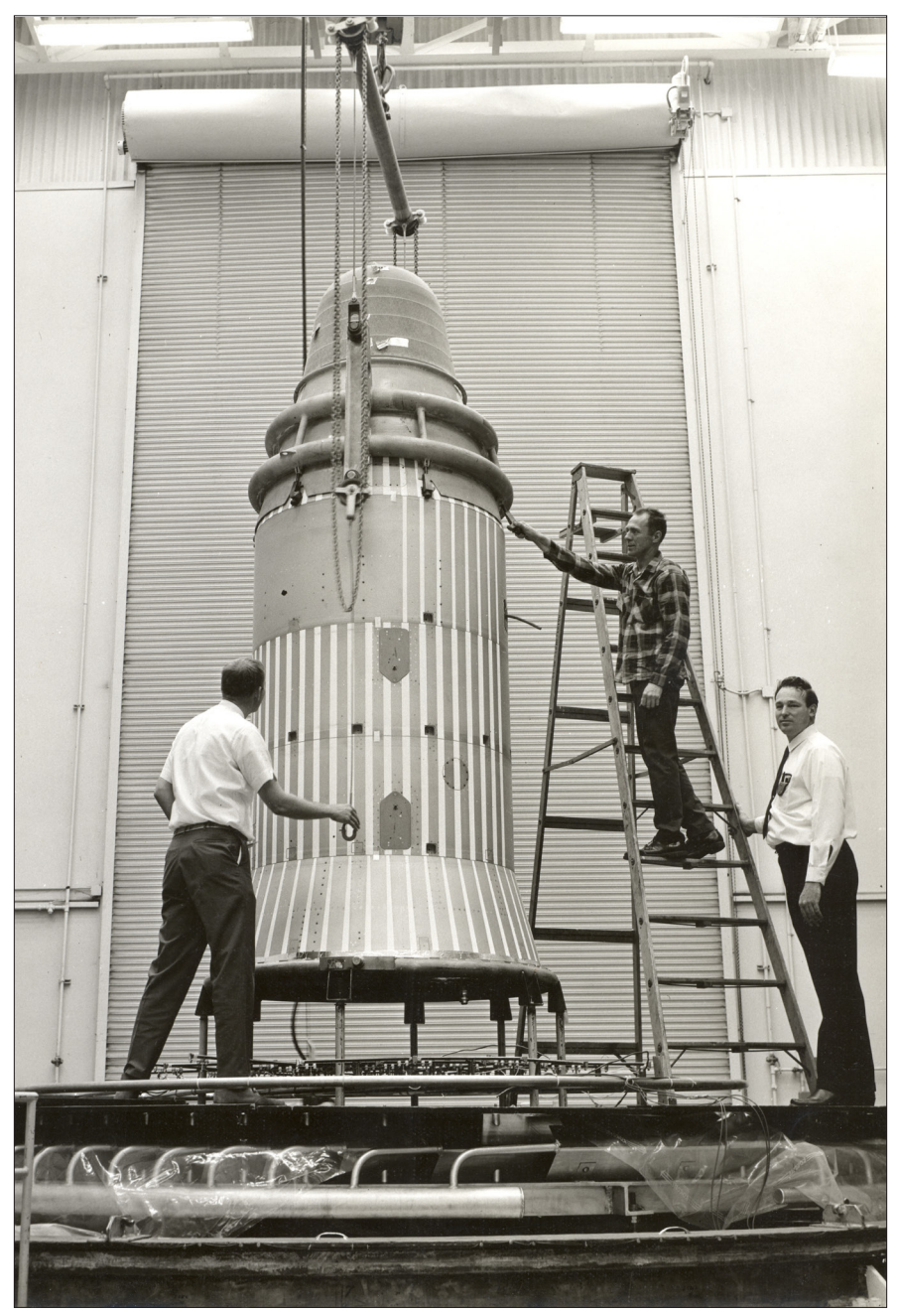
Figure 6: Engineers Ready Corona