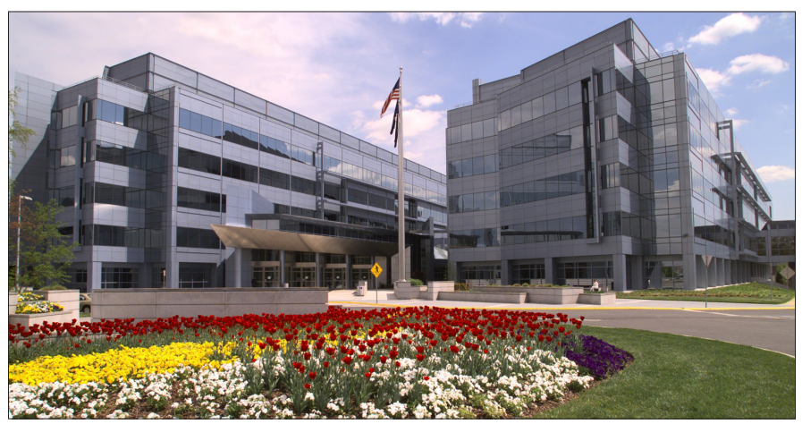
Figure 13: NRO Headquarters Today

The IMINT components—the Future Imagery Architecture (FIA)—were much more problematic. FIA was the first IMINT system NRO developed after the dissolution of the alphabet programs. The reorganization had broken up the Program A and Program B teams that had developed the earlier systems. The NRO required the FIA contractor to build the system to a specified, not-to-exceed cost (a direct result of policies resulting from the forward funding controversy), gave more responsibility to the contractor to manage the program (to improve efficiency and