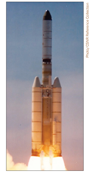
Figure 10: Hexagon Launch