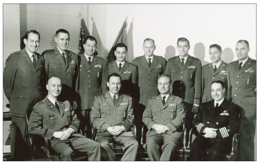
Figure 1: Original National Reconnaissance Staff, 1961