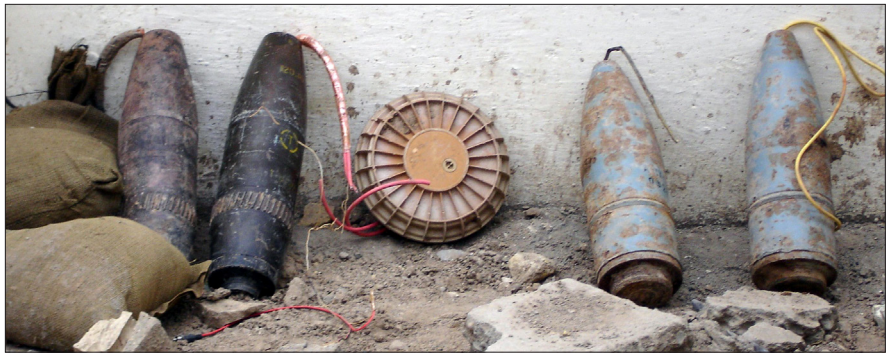
Figure 14: IED Munitions in Baghdad

The NRO routinely collects intelligence for U.S. military operations, and in today's environment this support is more likely to be "multi-INT," combining overhead intelligence with other data. The NRO's workforce today thus includes personnel from throughout the Intelligence Community. NSA and NGA personnel are often assigned to NRO facilities. Similarly, because U.S. forces are most likely required to operate as members of a coalition, the NRO workforce also includes representatives from the United Kingdom, Australia, Canada, and New Zealand. NRO personnel themselves today more frequently deploy "downrange" with more than 40 people typically deployed in combat theaters. (Sapp, 2010)