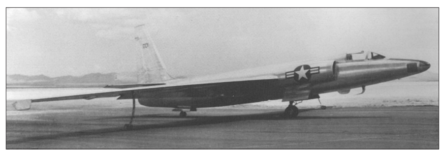
Figure 2: The U-2 Aircraft